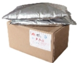
The Specification of Spray Dried Tomato Powder